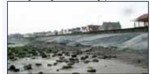
Existing defences at the south end of South Bay will be improved

By the boating ponds there will be some smaller rock landscaping to reduce water running through the access gaps.